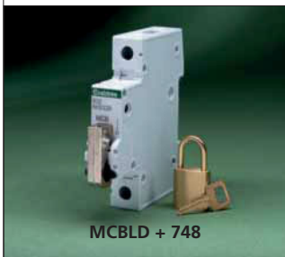
MCBLD + 748