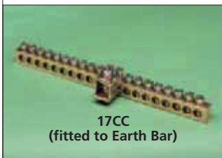
17CC (fitted to Earth Bar)