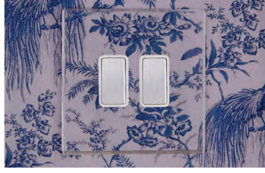
PC 1XTS SC-W